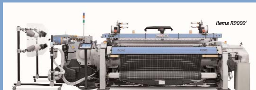
IteMa R9000 2

Produced and assembled in the IteMa manufacturing plant in China, the R9000 comes at ITMA Asia in a fully revamped version by borrowing some of the latest Second Generation technological advancements implemented on the IteMa R9500 2 denim. The R9000 Second Generation will set the machine even further apart from its competition due to tangible and substantial benefits for the weaver. In fact, the R9000 2 has been implemented with optimized components and mechanical highlights leading to significant energy saving and performance improvements compared to the previous model. Moreover, the new machine's ergonomic guarantees an outstanding user-friendliness by facilitating machine accessibility for the weaver when carrying out daily textile operations and the IteMa Electronic NCP – New Common Platform – comes here loaded on a high-performance, super sensitive touch-screen console.