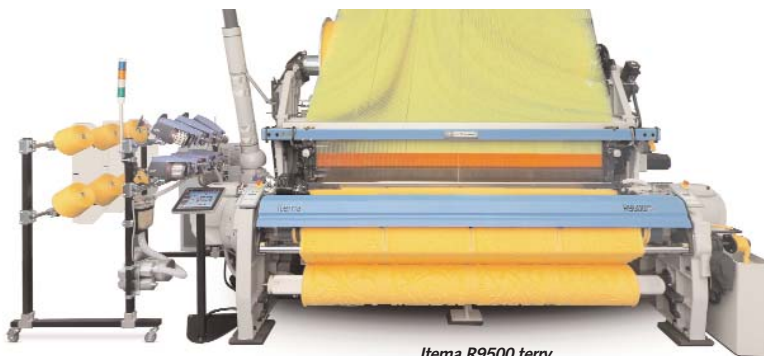
IteMa R9500 terry.

Developed to run faster and launched in the market during ITMA Asia in 2014, the A9500p is today a real market success due to its tireless production capacity demonstrated in the most demanding Indian mills where a huge number of A9500p daily weave non-stop and with superior fabric quality the widest range of apparel fabrics at the highest production speed. The A9500p on display during the upcoming ITMA Asia will be equipped with all the outstanding technological advancements which make this machine the most innovative airjet in the playground, including the IteMa Double Tandem Nozzles which provide superior