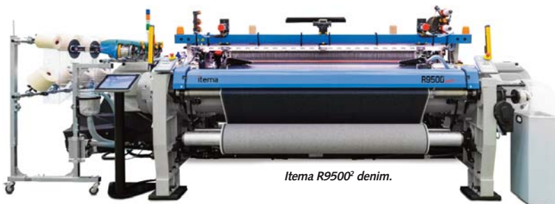
IteMa R9500 2 denim.