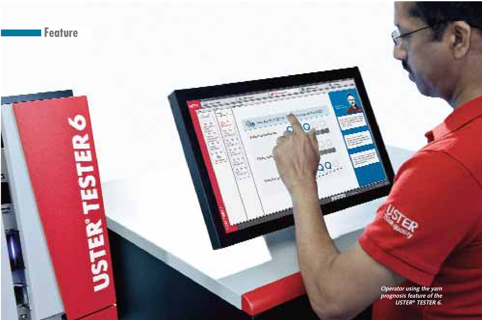
Operator using the yarn prognosis feature of the USTER® TESTER 6.