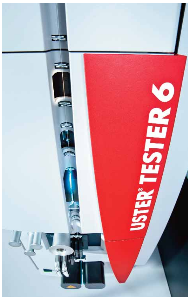
USTER® TESTER 6: Optical sensors including the new sensor for hairiness length classification.

This enormous mass of data requires built-in intelligence to transform it into quick and easy-to-follow guidance for the spinner. Quality alerts provide an early warning of potential issues, allowing spinners to identify and remedy any faults likely to cause second-quality material. Objective guidance helps spinners to categorize quality levels, using the so-called 'yarn grades', while critical questions about a yarn's performance in subsequent