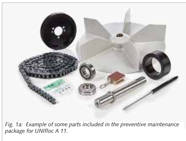
Fig. 1a: Example of some parts included in the preventive maintenance package for UNIfloc A 11.

Cost savings – considerably lower costs when acquiring the parts as a package.