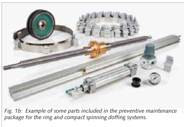
Fig. 1b: Example of some parts included in the preventive maintenance package for the ring and compact spinning doffing systems.