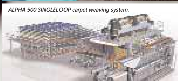
ALPHA 500 SINGLELOOP carpet weaving system.