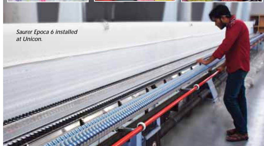
Saurer Epoca 6 installed at Unicon.