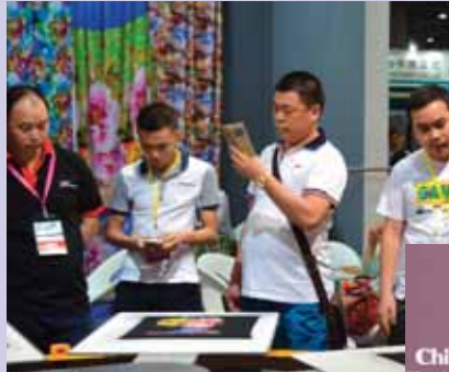
The CITPE 2017 will present a visual and auditory experience for buyers and visitors.

CITPE2017 focuses on the challenges faced by the textile printing industry and will be attended by industry experts and guests from around the world. The show is expected to bring a variety of hot topics into the spotlight. With various activities including industry and technology Forums, networking events and product displays.