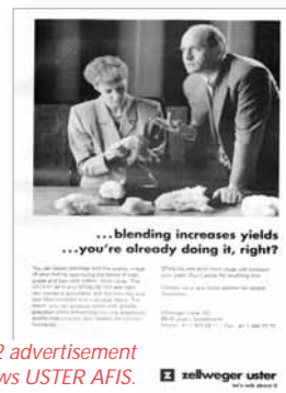
Circa 1992 advertisement shows USTER AFIS.