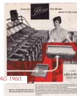
SSM AG 1960.