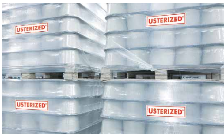
USTERIZED® labeling is a prized badge of yarn quality.

The value that spinners place on their USTERIZED® recognition is underlined by the efforts made by so many to pass the regular audits – in some cases for 10 years and longer. The count of long-term and new members at the end of 2016 showed that India now has the largest number of USTERIZED® spinners. Other strong USTERIZED® markets are in China, Turkey, Indonesia and Pakistan. These spinners, and others worldwide, have earned the right for their yarn to carry the USTERIZED® brand label – for instant recognition of quality consistency in trading and deliveries to fabric producers. ♦