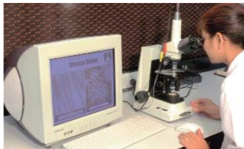
Texanlab is an accredited test institute for international brands and retailers.

with strict European environmental regulations and saves energy, raw material and waste, compared to traditional wet-chemical methods" he said.