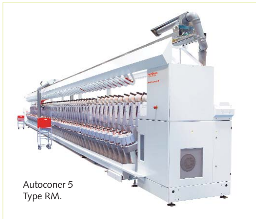
Autoconer 5 Type RM.

At ITMA in Munich, Oerlikon presented the fifth generation: the Autoconer 5. This new development once again takes account of the latest demands of the market and customers and integrates future-oriented, innovative engineering. The advantage that the Autoconer 5 offers are precisely those services, that makes a spinner strong for successful business in the global textile industry. In future you can produce in a quicker, more demanding, more efficient, more intelligent and more reliable way.