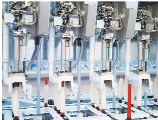
Autoconer 5 Type D1

The Autoconer 5 produces high-end packages that are worth their price today and tomorrow. With Autotense FX, Propack FX, Variopack FX and Ecopack FX, you're unbeatable when it comes to package quality. Your valuable yarn receives gentle treatment on the Autoconer 5 - the greater linearity of the yarn path with its optimized arrangement of the units and the new waxing unit see to that. Its unique splicing competence is based on the universality of the splicing technology.