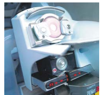
Autoconer 5 Waxing.