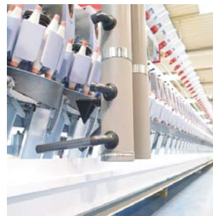
Autoconer 5 Type RM 1.