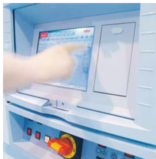
Autoconer 5 Informator.